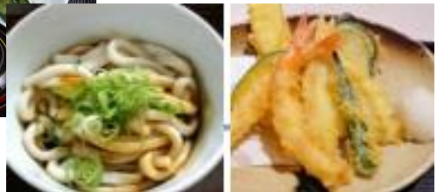
Examples of dishes for Muslim travelers