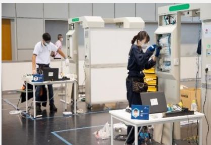
Optoelectronic Technology 46th WorldSkills Competition Kyoto