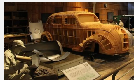
Toyota Commemorative Museum of Industry and Technology