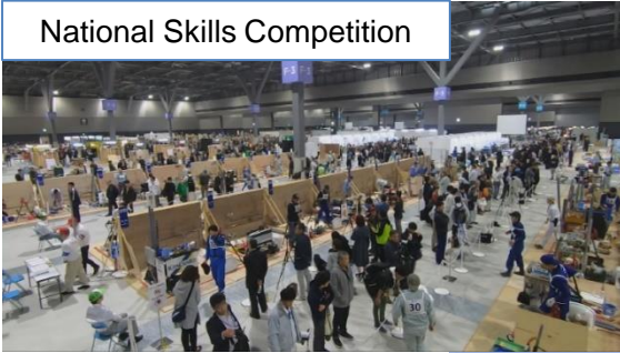
National Skills Competition